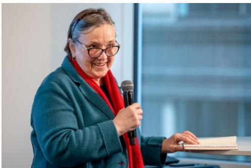
Róża Thun

Born in 1954 in Kraków. General Director and Chairwoman of the Polish Robert Schuman Foundation (1992 – 2005). Head of the European Commission Representation to Poland (2005 – 2009). From 2009, Róża Thun is serving as a Member of the European Parliament (EP). In the EP, she works in three Committees: Internal Market and Consumer Protection (IMCO), Environment, Public Health and Food Safety (ENVI) and Committee on Civil Liberties, Justice and Home Affairs (LIBE). She’s member of delegation to the EU-Kazakhstan, Kyrgyzstan, Uzbekistan and Tajikistan